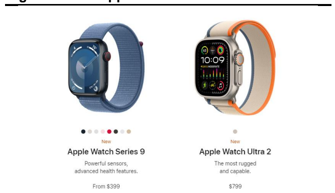
Figure 3: New Apple Watch series 9 and Ultra