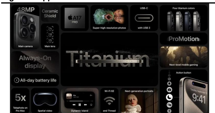
Figure 2: Apple iPhone 15 Pro series