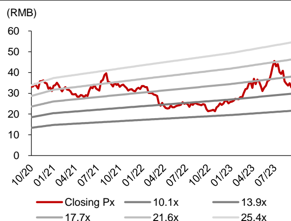
Figure 3: 12M forward P/E chart