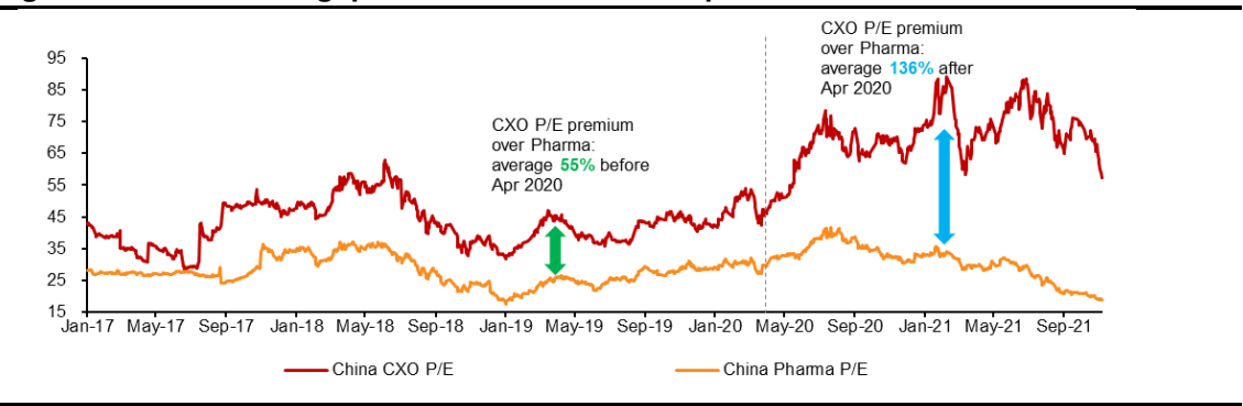
Figure 2: Historical PE gap of China CXO vs China pharma