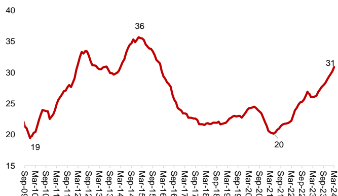
General inventory month

The move sent another signal that the Chinese government's strong intention to stabilize the property market. The reported move is positive to developers in general. Nonetheless, the impact to individual developers in the near-term will vary. For developers already in default with a high inventory level, they may be pressured to sell projects to local governments/LGFVs at deep discounts. These could affect the overall recovery value, especially from offshore bondholders' perspective.