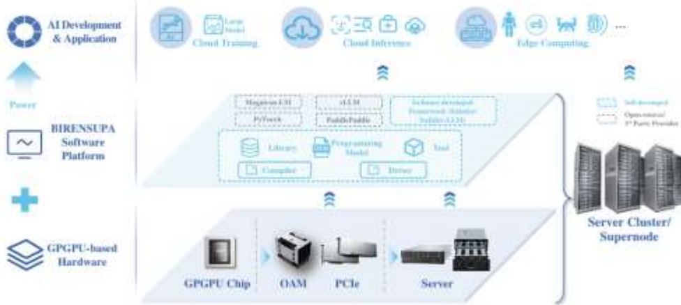
Figure 2: Biren's "1+1+N+X" full stack GPGPU solution