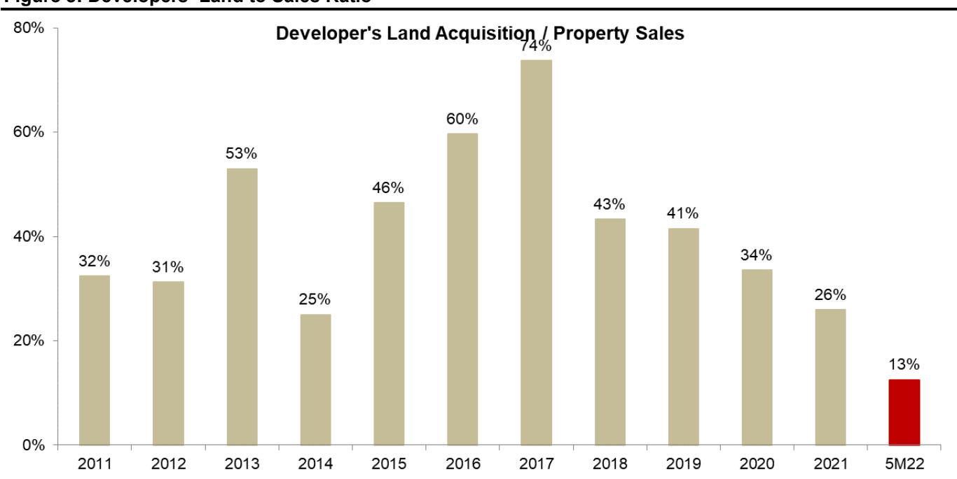
Figure 5: Developers' Land to Sales Ratio