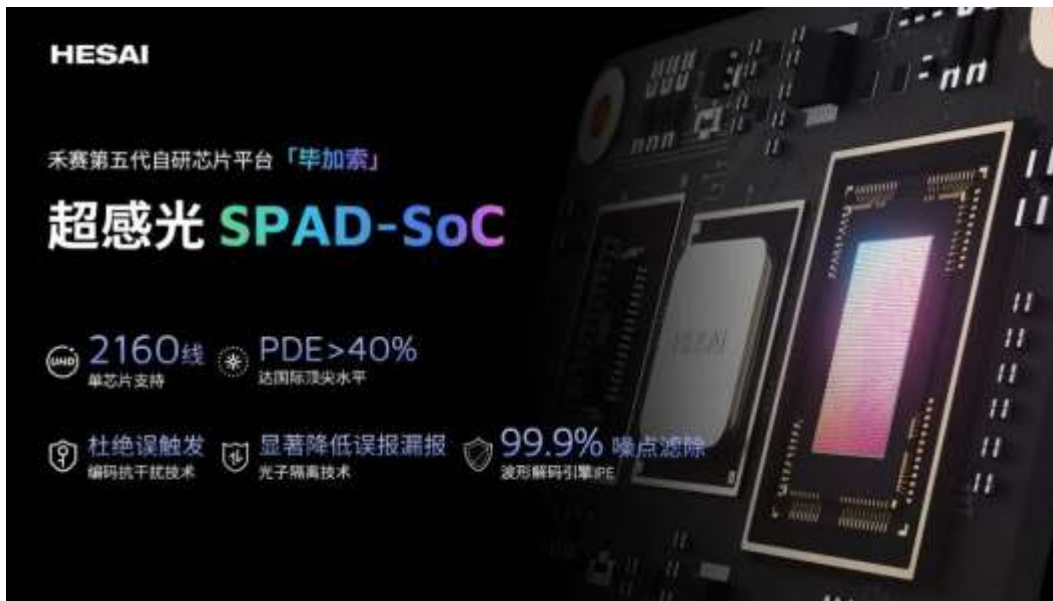
Figure 1: Hesai: Picasso SPAD-SoC