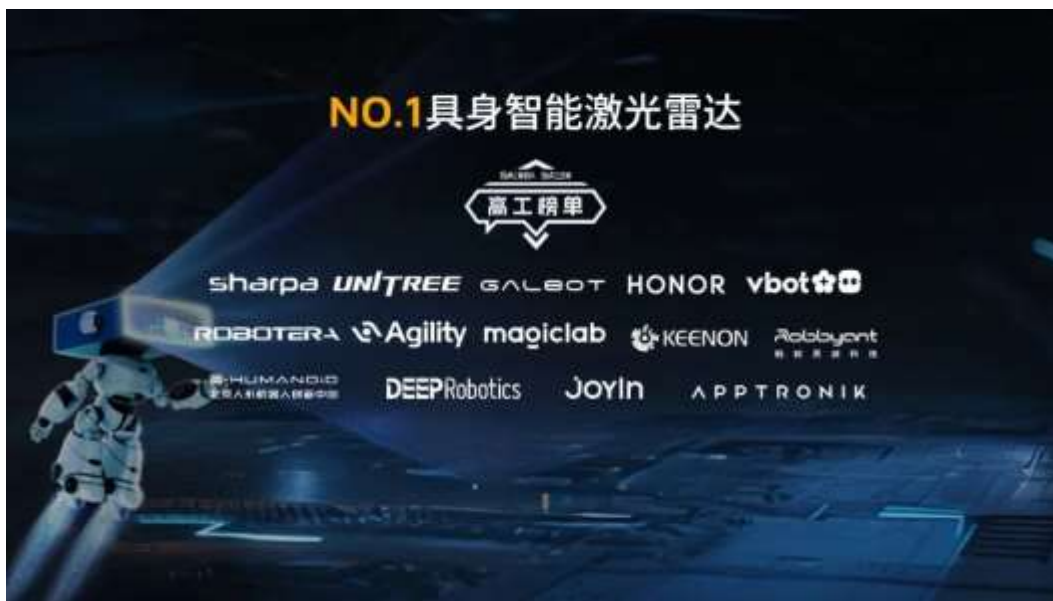
Figure 2: Hesai: customer list in Humanoid robot industry