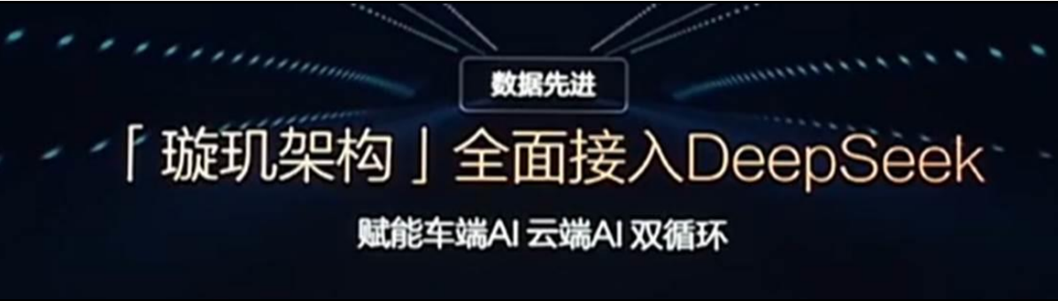
Figure 3: Integration with DeepSeek on both vehicle and cloud platforms