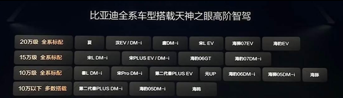
Figure 2: BYD's all models are equipped with "God's Eye" advanced intelligent driving