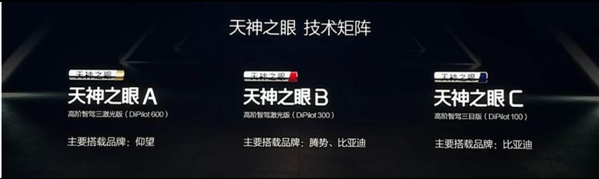
Figure 1: BYD's self-developed "God's Eye" intelligent driving system