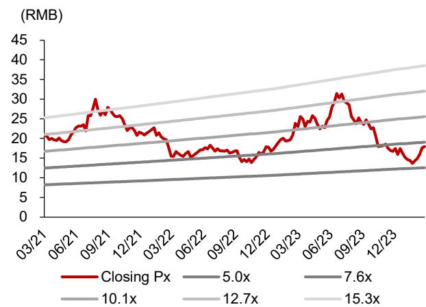
Figure 2: 12M forward P/E chart