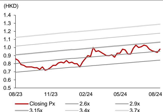
Figure 2: EV/EBITDA chart