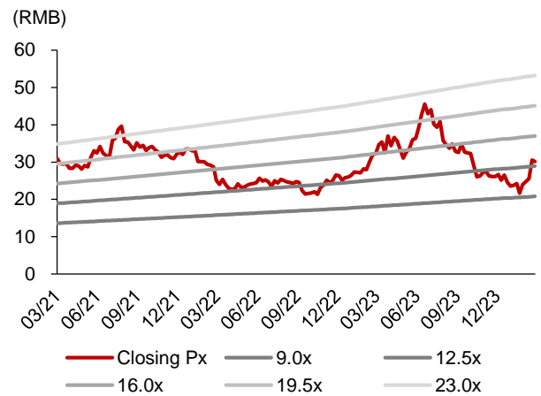
Figure 2: 12M forward P/E chart